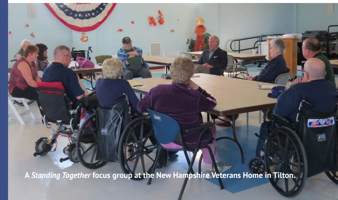
A Standing Together focus group at the New Hampshire Veterans Home in Tilton.